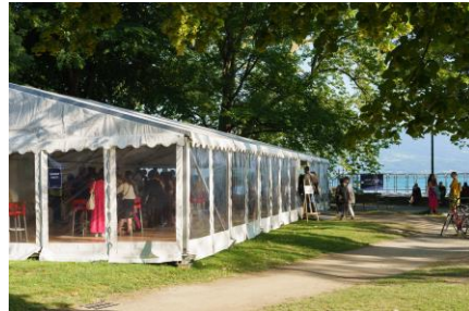
Garden Party 200m 2

Located on the lake platform of the Exhibitors' marquee Capacity: 100-300 people