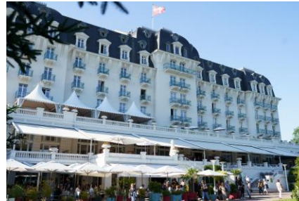
Congress Center Imperial Palace

Located in the grounds of the Imperial Palace Capacity: 100-200 people