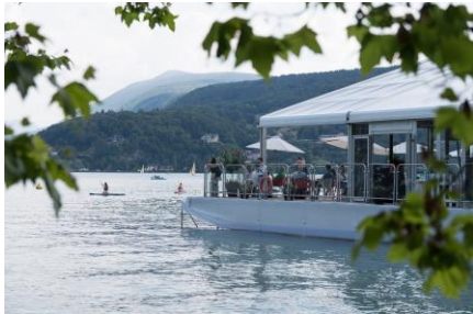
Chill Out area 400m 2

Located on the lake platform of the Exhibitors' marquee Capacity: 100-300 people