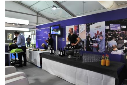
Cocktail on Stand Exhibiting area

Take advantage of your stand to invite accredited guests