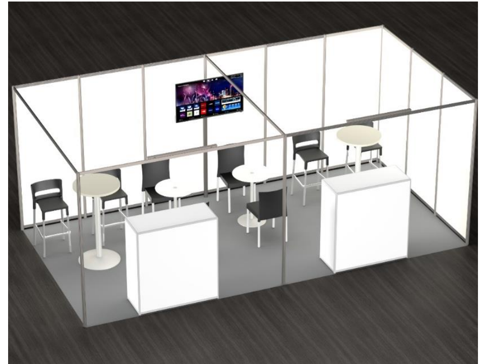
An example of an equipped 4m 2 stand (non-contractual photo)